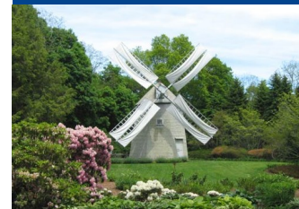
One of Cape Cod's many Windmills